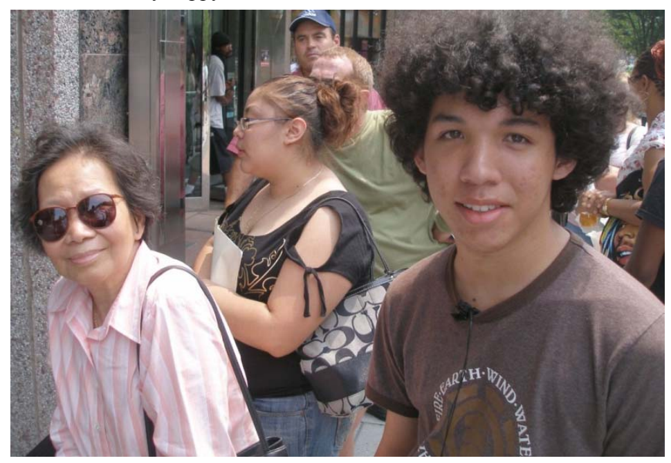
Around 3:00 pm, I was still waiting for my passport and I got worried because I suddenly remembered that the office closes at 3:00 pm. I was reassured by a woman near me that although the stop letting new people in at 3:00 pm, people often wait inside until 8:00 pm for their passports.

He smiled, He said that he really liked xkcd and a lot of his classmates did too. He talked about the raptors. Now I was really happy. Isn't it a small world.